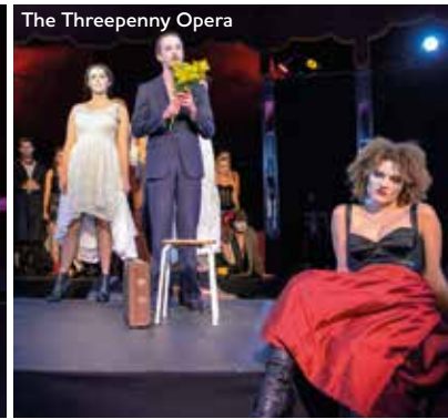
The Threepenny Opera