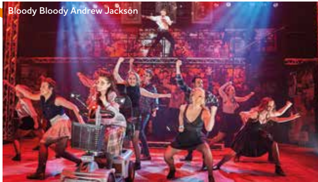
Bloody Bloody Andrew Jackson