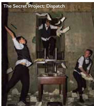
The Secret Project: Dispatch