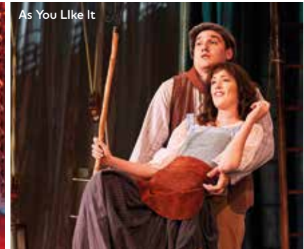
As You Like It