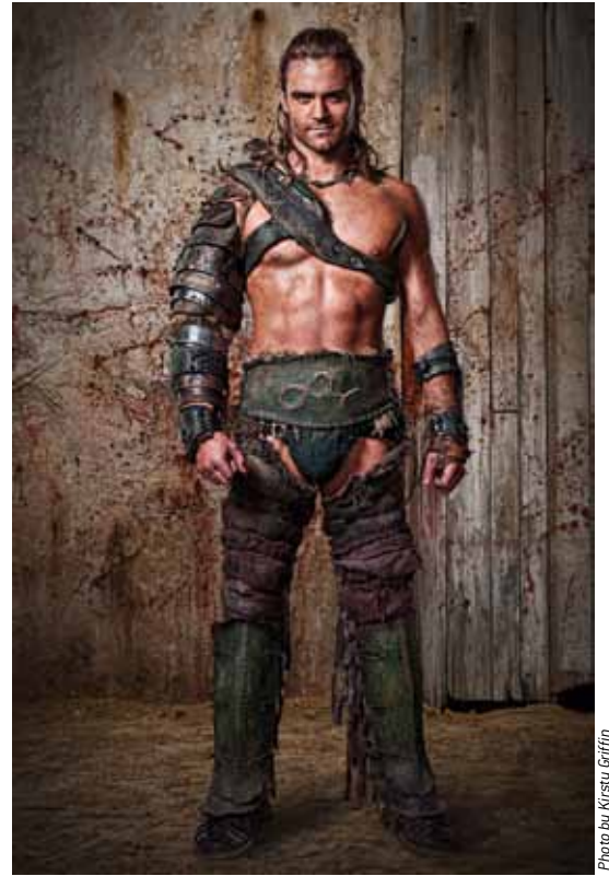
Dustin Clare in 'Spartacus', Gods of the Arena

I have spent a lot of time on and off in the states. I did my first trip after working for two and half years in the Australian industry. I don't particularly like it, and to be honest with you Hollywood is in fact, contrary to popular belief, a bit of a dump. People hype it up and get carried away with it, but in truth that's what it is. It's also for me been a marketplace that I have always wanted to enter, and there is a huge amount of work generated from there. I want to be able to tell stories on a global scale, and for me I love the challenges and complexities of working in front of the camera. So the states has always been somewhere I have wanted to challenge myself, in honesty it's probably been something I have wanted to prove to myself more than anyone else. Our industry is very global now, it's much more connected. In saying that I also feel a duty to tell stories from my own culture and country, to contribute to the storytelling of who we are as Australians in the world, and I think that's very important. I have heard stories of graduates taking the trip over to the states pretty soon after they graduate and it's not something I would recommend, work on your craft at home, fine tune it before you decide to make that leap. If you're lucky enough your career will be wherever you choose to make it, and whatever part of the industry you feel most passionate about.