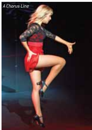
A Chorus Line