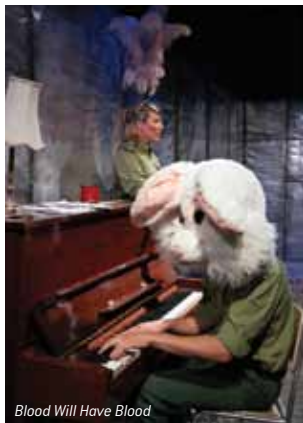
Blood Will Have Blood