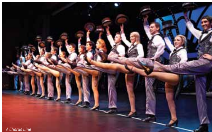
A Chorus Line