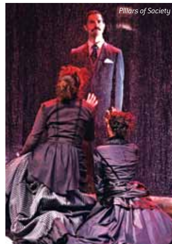
Pillars of Society