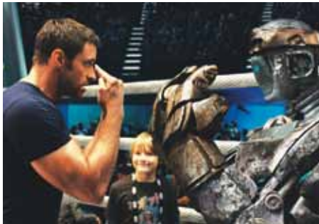
Hugh Jackman in 'Real Steel'

HUGH JACKMAN (1994) stars in the science fiction film, Real Steel , released worldwide in October and also had a feature role in the Wendi Deng-produced movie Snow Flower and the Secret Fan . Jackman is currently shooting the fifth instalment of the X-Men film franchise, The Wolverine , in Japan. Early next year Jackman begins filming the upcoming screen adaptation of the musical, Les Miserables , in which he plays the principal role of Valjean. Les Miserables will be directed by Tom Hooper of The King's Speech fame.