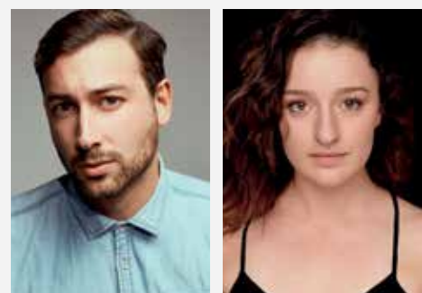
Winners of the Leslie Anderson Awards