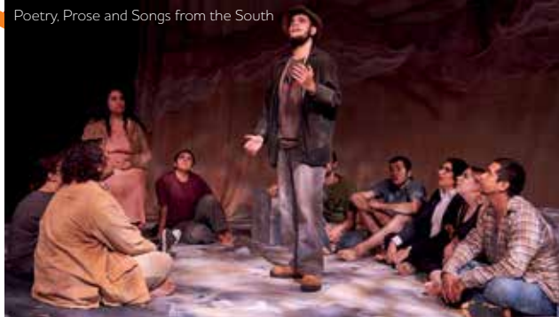
Poetry, Prose and Songs from the South