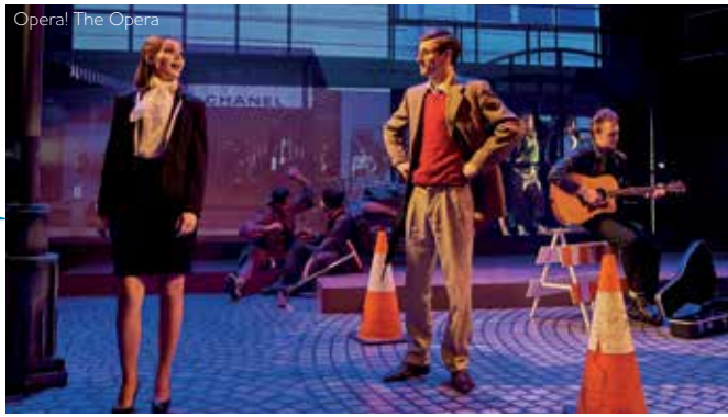
Opera! The Opera

A GLIMPSE OF WHAT'S BEEN HAPPENING ON STAGE AT WAAPA