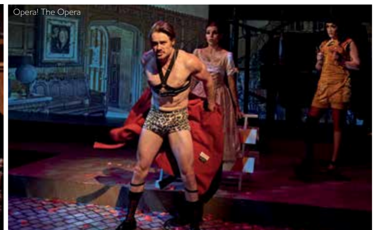
Opera! The Opera