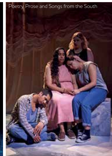
Poetry, Prose and Songs from the South