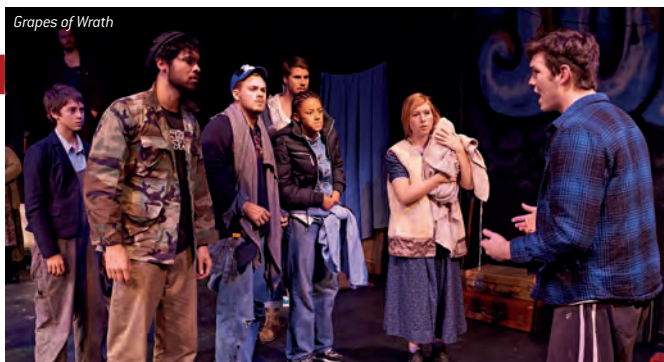
Grapes of Wrath