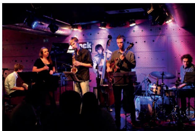
Jazz students performing at the Jazz Dock Bar in Prague, Czech Republic

After the festival the students travelled to various cities in Europe to attend dance workshops and performances.