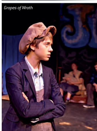
Grapes of Wrath