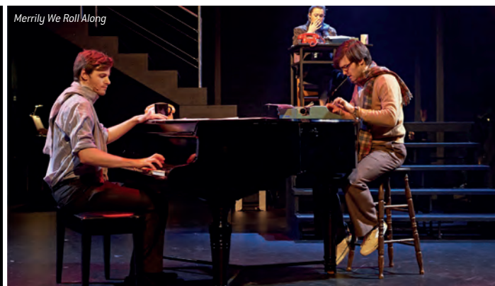
Merrily We Roll Along