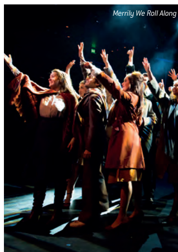
Merrily We Roll Along