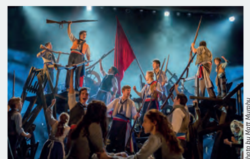
The Barricade scene from the 2014 Australian production of Les Misérables