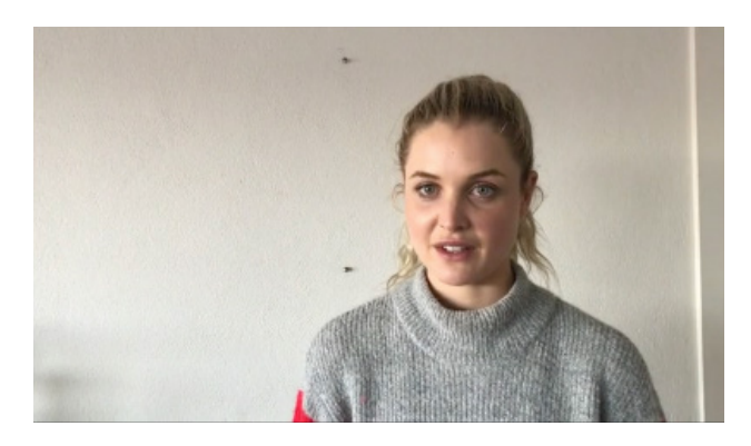
Eye line is Right-to-Left (actor is slightly to the Right of centre)