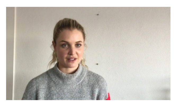
Eye line is Left-to-Right (actor is slightly to the Left of centre)