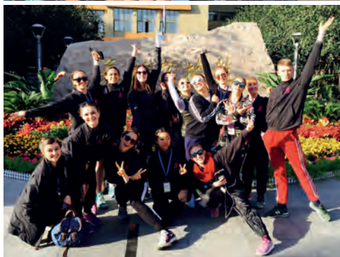
WAAPA's Advance Diploma Dance students taking in the sights.